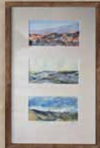
Cowiche Canyon Seasons W. D. Frank Watercolor $350