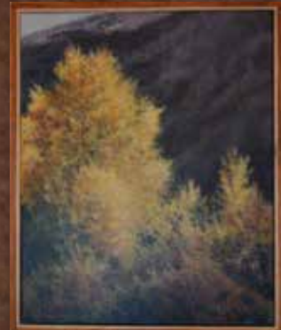
Sunlit Bill Brennen Acrylic on canvas $500