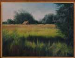
Across the Field Bill Brennen Acrylic on canvas $2400