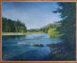
Naches River Bill Brennen Acrylic on canvas $3200