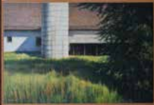
Shadows Bill Brennen Acrylic on canvas $500