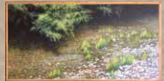
Shallow Water Bill Brennen Acrylic on canvas $1600