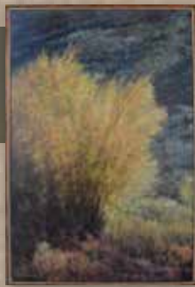
Cowiche Canyon Bill Brennen Acrylic on canvas $1200