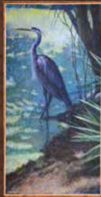
Heron Bill Brennen Acrylic on canvas $1600