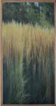
Grasses Bill Brennen Acrylic on canvas $1600