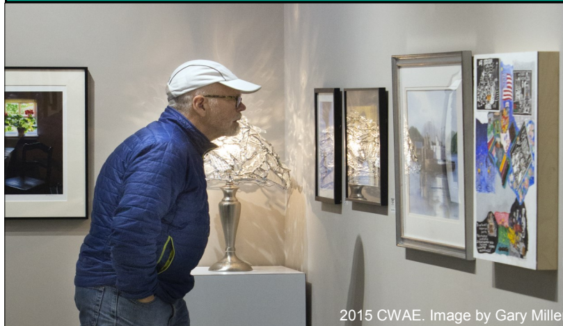
2015 CWAE.