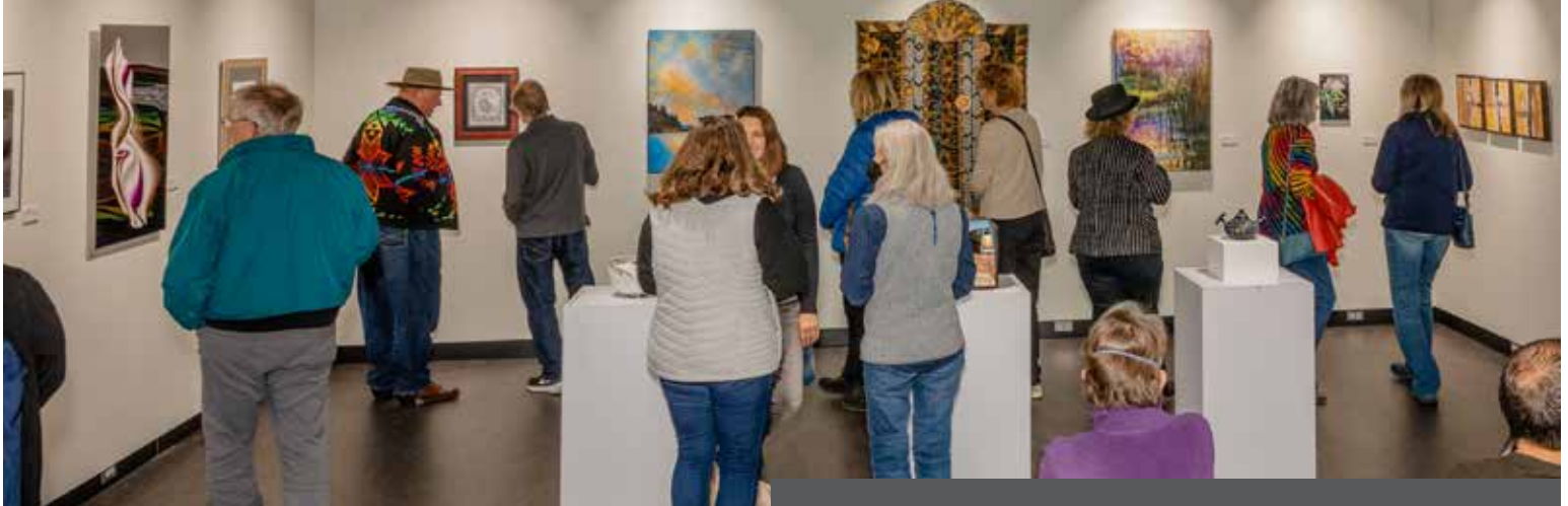
Visitors enjoy the opening of the Central Washington Artists' Exhibition.